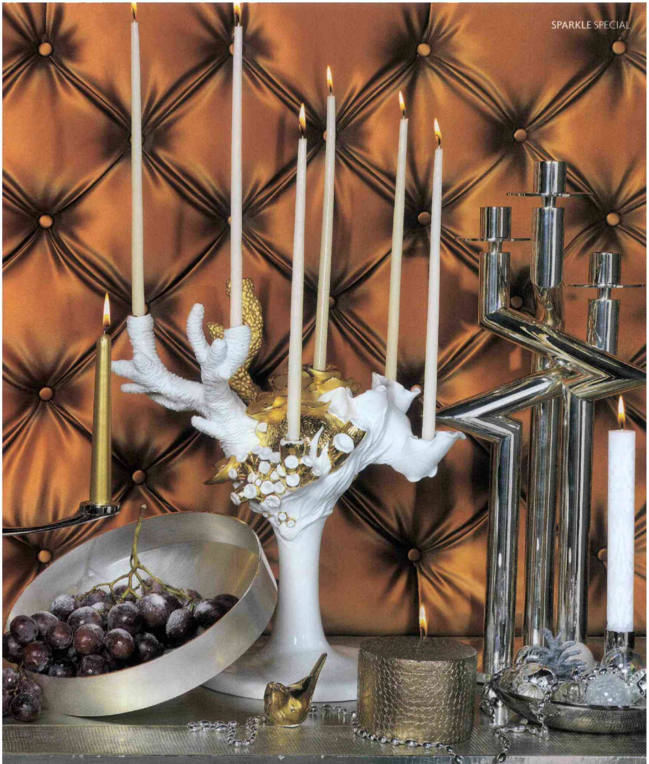
Left to right: Sterling silver pivot dish, £3,500, at Angela Cork; Naturalistic candleabra in gold, £1,000 (candles included), at Lladro; Gold Finch, £32, by Shan Arambelic Valla at Hidden Art Shop; Valley candle, £9, at Zara Home; Zigzag candelabra, £5,139, at Harrods; Candleholder, £68, by Georg Jensen at Harrods; Rawhi Two drawer console table, £1,200, at DeZoruma; Padded background covered in Goede Culvre 434-6 fabric, £56 per m., at Lelievre.